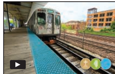
Promo video available for your church website.